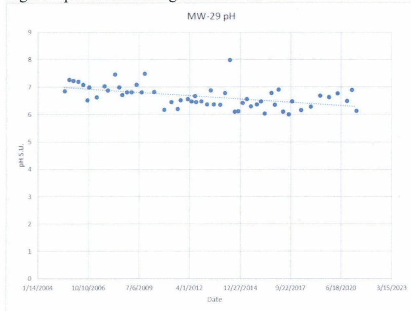
Figure – pH in monitoring well MW-29

Section 3.1 of the SAR includes a summary of site-wide decreasing pH and refers specifically to the discussion of “Site-Wide Decreasing pH,” due to pyrite oxidation, Per the SAR it was noted that between the time of installation and 2012 the pH at MW-29 was trending downward after which time it has stabilized and is showing recent upward trend. Per the DWMRC pH plot for MW-29 below it can be seen that the trends are evident but slight. The finding of slight trends and of trend reversal are not what would be expected if the pH changes were caused by the introduction of tailings wastewater which is highly acidic and would likely cause a marked decrease with an associated increase in indicator parameter concentrations. Therefore, per review of the pH data, findings are not consistent with a tailings source and may support findings of the previous and ongoing EFR pH and pyrite investigations.