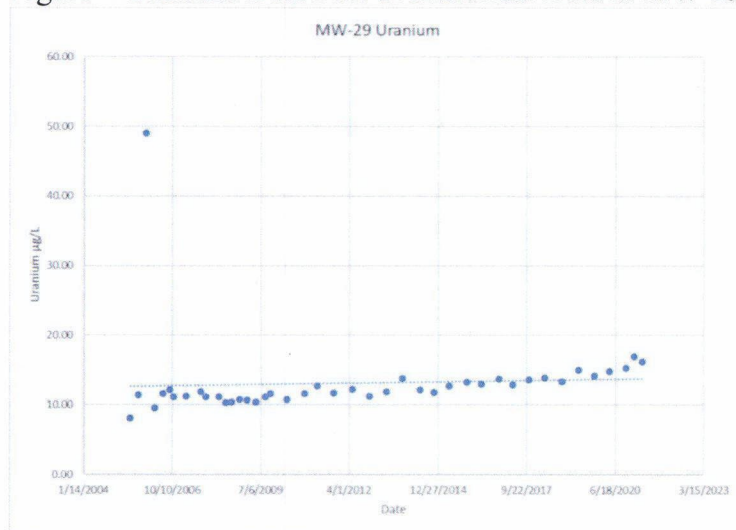
Figure – Uranium Data Plot of Historical Data at MW-29

Per the EFR SAR findings, the GWCL exceedances and data trends are not found to be caused by Mill activities (leakage from the tailings impoundments), and based on the increasing trends, EFR is proposing that a modified approach (background x 1.5) of a post July 2020 data set be used as a basis for the uranium GWCL. Per the plot, it does appear that the post July 2020 data represents a data inflection (steepening and new data distribution which appears more representative than previous data). EFR statistical review finds that the data within this period shows a normal distribution and justifies the use of the modified data set based on that finding and the finding that the increasing trend was previously identified and studied. The EFR proposal is consistent with the Director approved statistical flow chart and Environmental Protection Agency Guidance (EPA 2009) which allows consideration of a modified approach if a significant trend is evident. DWMRC review findings regarding the SAR, sitewide concentration comparisons, and the EFR proposed revised GWCL's is discussed below.