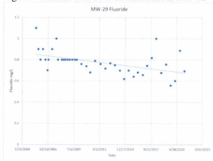
Figure – Fluoride Plot of Historical Data at MW-29 – Decreasing Trend